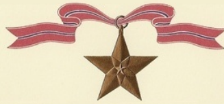
THE BRONZE STAR MEDAL FOR MERITORIOUS SERVICE