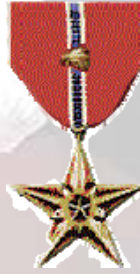
Bronze Star with Oak Leaf Cluster (2 awards)