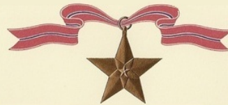
THE BRONZE STAR MEDAL FOR MERITORIOUS SERVICE