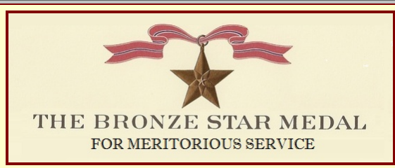
THE BRONZE STAR MEDAL FOR MERITORIOUS SERVICE