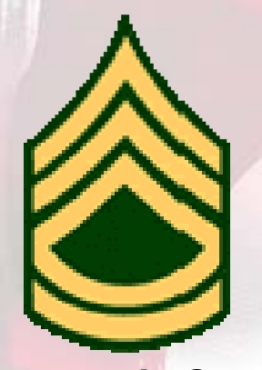
SERGEANT 1 ST CLASS