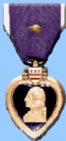
Purple Heart with OLC (2 awards)