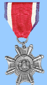
NY State Conspicuous Service