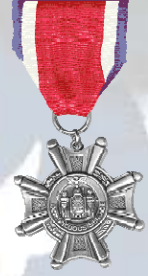
NY State Conspicuous Service