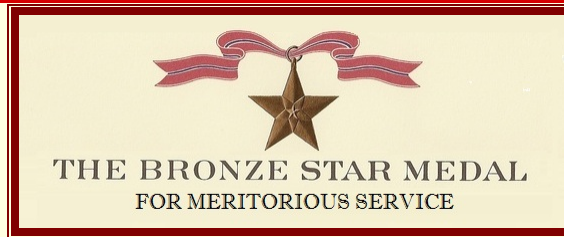
THE BRONZE STAR MEDAL FOR MERITORIOUS SERVICE

HQ 173RD AIRBORNE BRIGADE (SEPARATE) GENERAL ORDERS