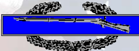
Combat Infantryman Badge