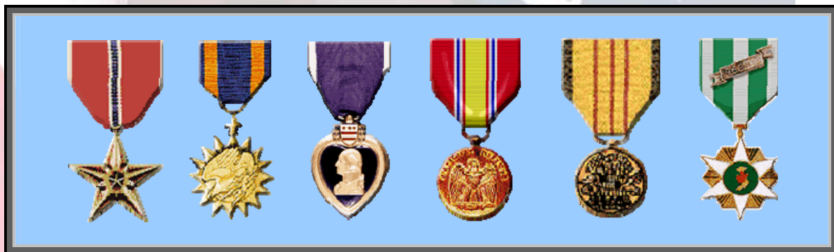
Bronze Star* ?