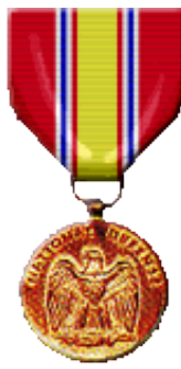
NATIONAL DEFENSE MEDAL