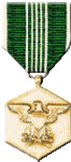
ARMY COMMENDATION MEDAL