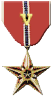
BRONZE STAR MEDAL (VALOROUS)