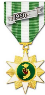
VIETNAM CAMPAIGN MEDAL