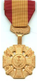
VIETNAM GALLANTRY MEDAL