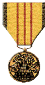
VIETNAM SERVICE MEDAL