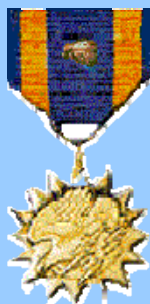
Air Medal with OLC