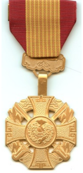
VIETNAM GALLANTRY CROSS