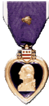
PURPLE HEART (MULTIPLE AWARDS)