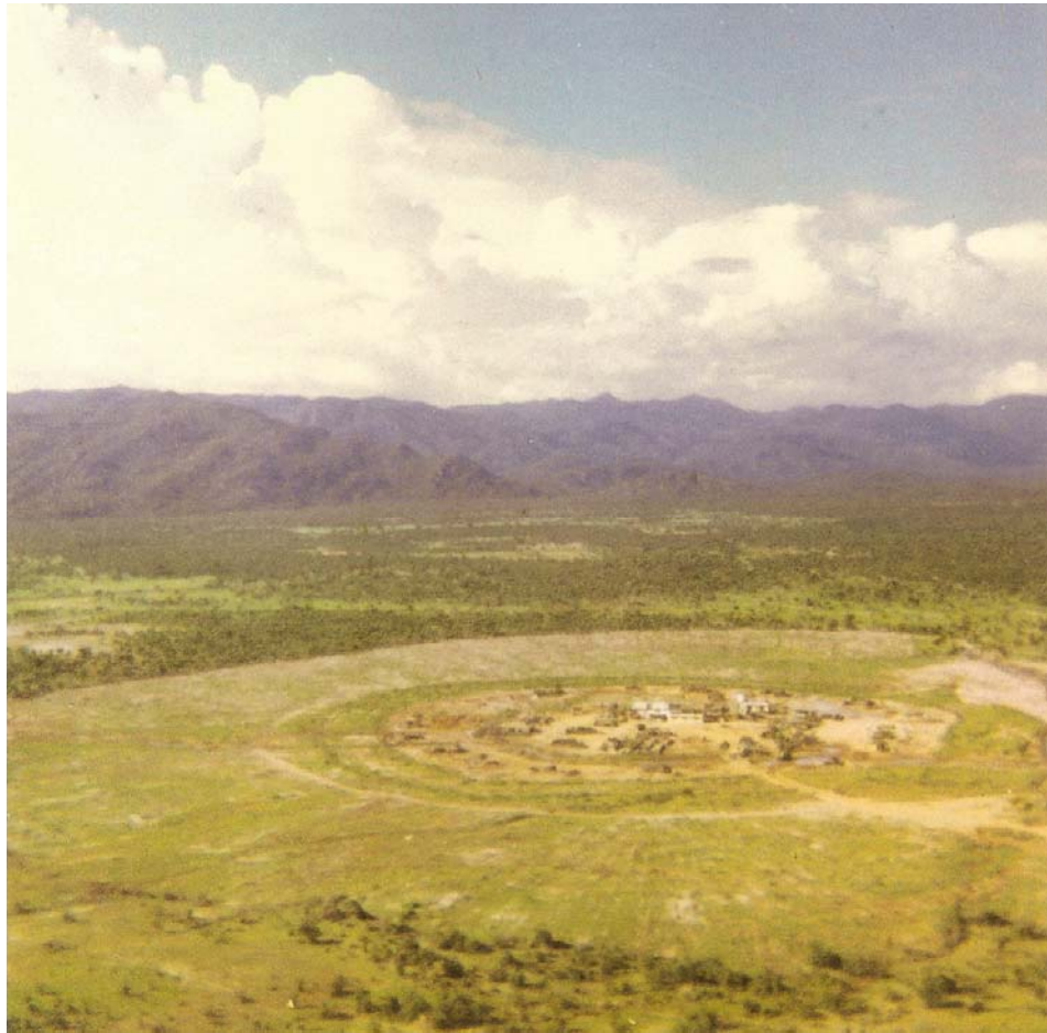
Aerial photo of Fire Base Panzer