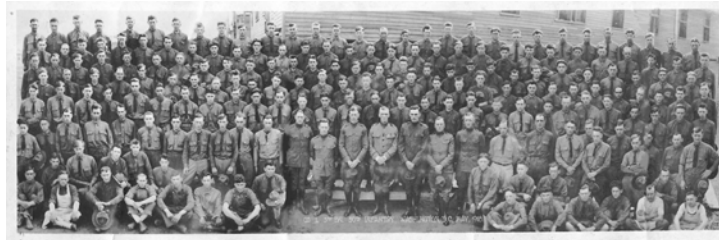
Company "L" shown here in Washington, DC in May of 1918.