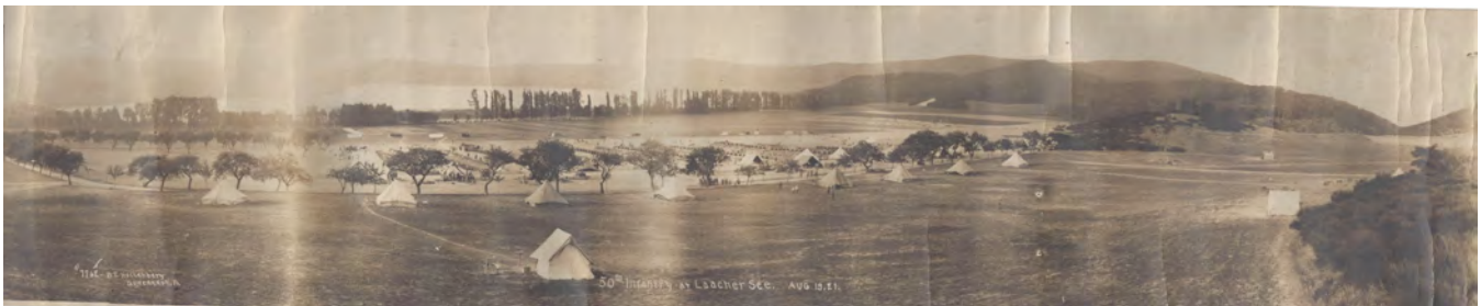
50th Infantry at Laacher See, August 1921