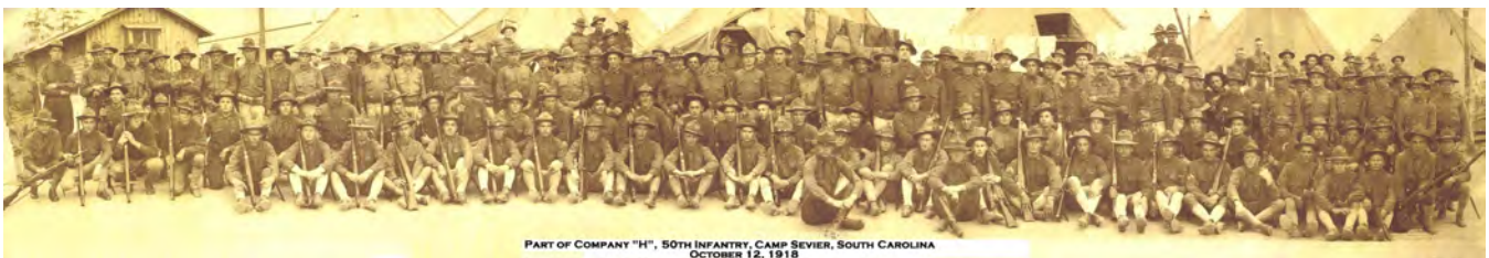
Company "H" at Camp Sevier, October of 1918

The Regiment had already received its orders that it would be deployed to Europe as part of the occupation forces when relieved from assignment to the 20th Infantry Division. They were, in fact, moved to Camp Dix, New Jersey in December of 1918 until departing by ship from the port of Hoboken, New Jersey on October 16, 1919.