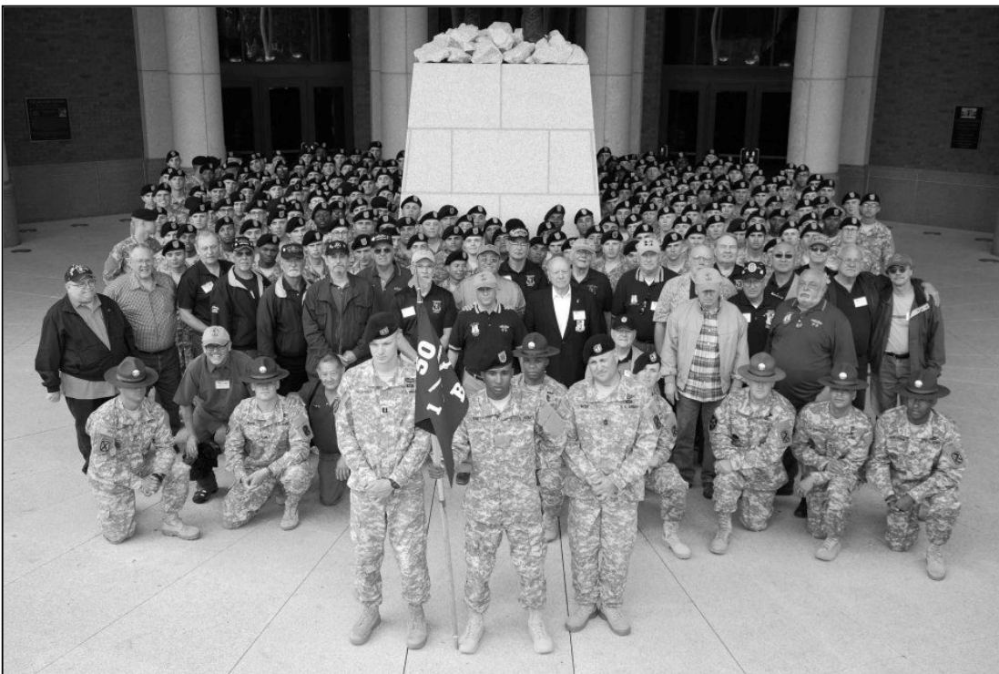
Formal 1/50 th Group Reunion Photo with representation from among active duty personnel, Ft. Benning, GA. 2013

So - once again, all details, plus a reservation form will be provided in the next newsletter, with all the gory details for you so you can make the call and get that room booked. See ya'll there!