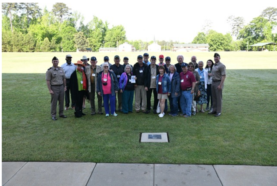
Last Association Reunion in 2023

I currently have a (mild form) of Diabetes that I was getting 10% 'disability' for; that just jumped up to 60%, along with hypertension (another 20%). Money-wise; we're talking about an ADDITIONAL $1,500 a month for compensation. Knowing that ALL of us are getting older, and any medical conditions that we have are only getting worse, I feel that 'our brothers' should know about this so they can live the rest of their lives a little easier.