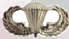
Airborne Jump Wings (Basic Parachutist Badge)