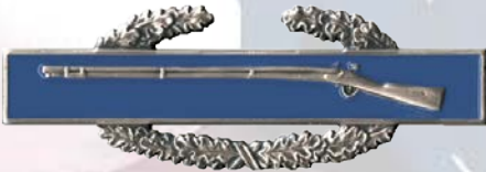
Combat Infantry Badge