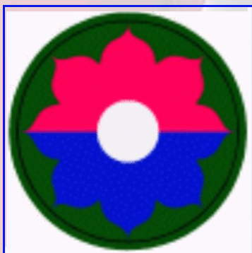
9TH INFANTRY DIVISION