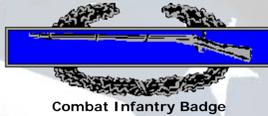
Combat Infantry Badge