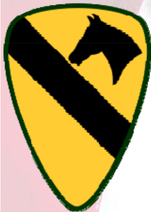
1 ST AIR CAVALRY DIVISION