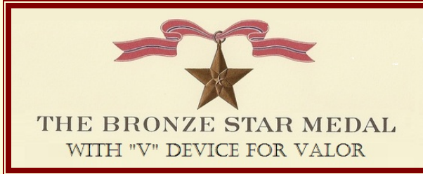
THE BRONZE STAR MEDAL WITH "V" DEVICE FOR VALOR