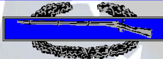
Combat Infantry Badge