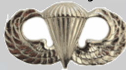
Airborne Basic Parachutist Badge