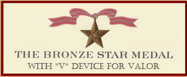
THE BRONZE STAR MEDAL WITH "V" DEVICE FOR VALOR