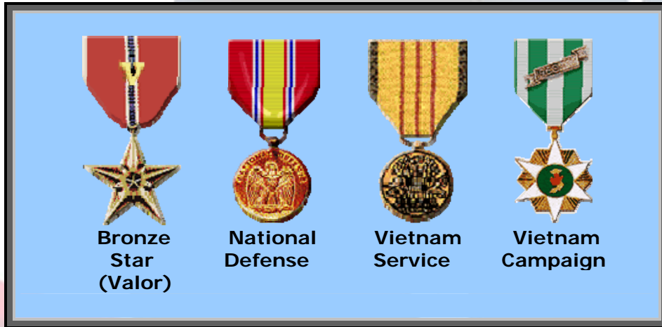
Bronze Star (Valor)