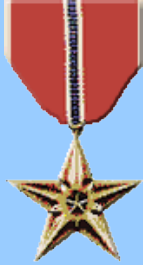
Bronze Star (Merit)