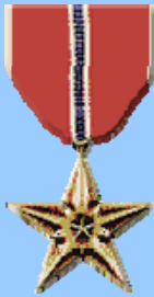
Bronze Star (Merit)