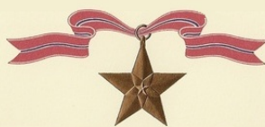
THE BRONZE STAR MEDAL WITH "V" DEVICE FOR VALOR