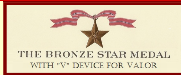
THE BRONZE STAR MEDAL WITH "V" DEVICE FOR VALOR