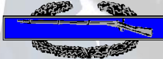
Combat Infantry Badge