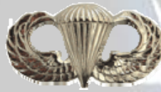
Airborne Jump Wings (Basic Parachutist Badge)