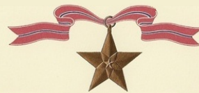
THE BRONZE STAR MEDAL WITH "V" DEVICE FOR VALOR

HQ 1ST CAVALRY DIVISION (AIRMOBILE) GENERAL ORDERS NUMBER 1051