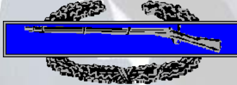
Combat Infantry Badge