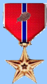
Bronze Star (2 awards)

FOR DISTINGUISHING HIMSELF BY OUTSTANDING MERITORIOUS SERVICE IN CONNECTION WITH GROUND OPERATIONS AGAINST A HOSTILE FORCE IN THE REPUBLIC OF VIETNAM DURING THE PERIOD FROM 6 DECEMBER 1967 TO 19 MARCH 1968. THROUGH HIS UNTIRING EFFORTS AND PROFESSIONAL ABILITY, HE CONSISTENTLY OBTAINED OUTSTANDING RESULTS. HE WAS QUICK TO GRASP THE IMPLICATIONS OF NEW PROBLEMS WITH WHICH HE WAS FACED AS A RESULT OF THE EVER-CHANGING SITUATIONS INHERENT IN THE COUNTERINSURGENCY OPERATION AND TO FIND WAYS AND MEANS TO SOLVE THOSE PROBLEMS. THE ENERGETIC APPLICATION OF THIS EXTENSIVE KNOWLEDGE HAS MATERIALLY CONTRIBUTED TO THE EFFORTS OF THE UNITED STATES MISSION TO THE REPUBLIC OF VIETNAM TO ASSIST THAT COUNTRY IN RIDDING ITSELF OF THE COMMUNIST THREAT TO ITS FREEDOM. HIS INITIATIVE, ZEAL, SOUND JUDGMENT AND DEVOTION TO DUTY HAVE BEEN IN THE HIGHEST TRADITION OF THE UNITED STATES ARMY AND REFLECT GREAT CREDIT ON HIM AND ON THE MILITARY SERVICE.