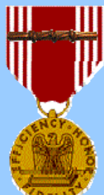
Good Conduct (3 awards)