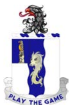
50 TH INFANTRY