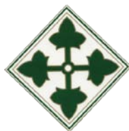
4 TH INFANTRY DIVISION