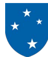
AMERICAL 23 RD INFANTRY DIVISION