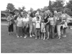
A picture taken at the 2011 Reunion

Ladies, we have not been very active this year. So we will have a meeting when the men have the executive meeting. Can't wait to see all of you. Play the Game.