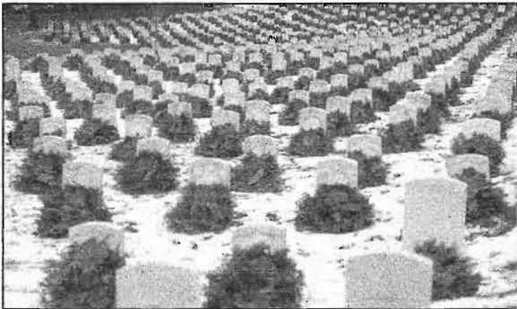
Join the Ladies Support Team for Wreaths Across America

I hope you are having a great summer. We are. Even though it is hot almost everywhere across the country, maybe it will help to cool you down if you think of Arlington in December. The 1/50 th Ladies Support Team and Association Members are once again going to participate in the Wreaths across America event. It is an honor to place wreaths on the graves of our nation's departed heroes. Taking part in this event is something you will never forget. So I am asking you to consider going this December 14 th and 15 th . Our schedule will be similar to last year's. On the 14 th we are looking at going to a nearby hospital for wounded warriors that is near Bethesda to help soldiers that do not get as much attention as do those at Bethesda. We will go to Arlington after breakfast on the 15 th . The ceremony and wreath laying take approximately three hours from 12:00 to mid-afternoon. Afterward, we can sightsee, etc.