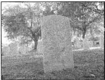
Beaufort National Cemetery

Many of you know I have an ongoing search in progress for photos of our men killed in action. We have whittled our list of needed photos down to slightly less than 50 men.